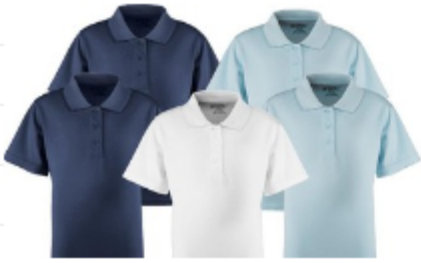
Navy, White, or Powder Blue Collared Shirt