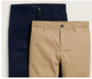
Navy or Khaki Bottom